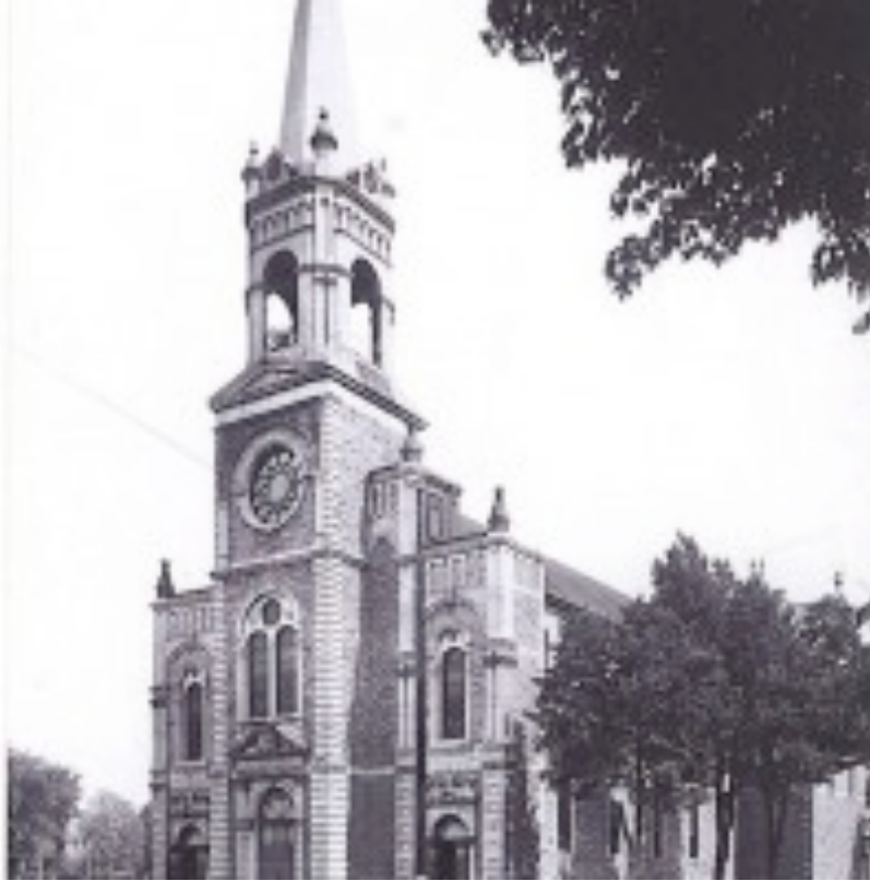
St Joseph's Church, Sandy Hill: the second building 1898-1930.

were granted loans of $4000, the maximum amount allowed for a solid brick house, payable in installments as building progressed.