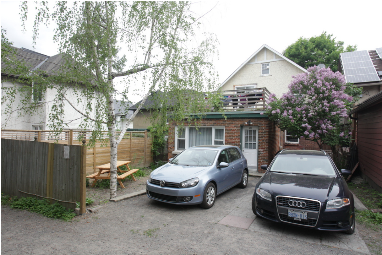
The one-storey addition to no 78, photographed in 2014.

race. The offset design left the original rear door clear for continued use, although it appears to have been closed off later (Building permits file, plans of July 27, 1948).