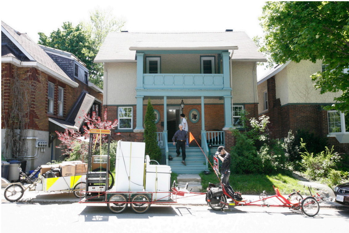
Moving day at 80 Wurtemberg, 2007.

With this preparation, 38 solar panels were installed in January 2012, and the first power delivered to the Ontario Power Authority that same month. In February 2014 two additional panels were installed in the space formerly occupied by two brick chimneys (tricolour.ca – Tricolour Solar Roof microFIT installation).